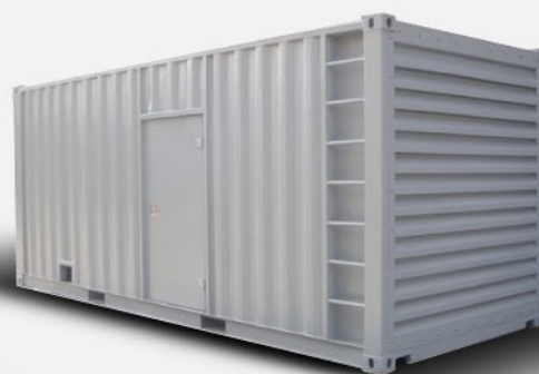
SOUND ATTENUATED CONTAINERIZED TYPE